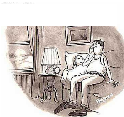
"Are you just back from work or on your way to the office?"

Michigan State University scientists say the number of workplace accidents spikes after the switch to Daylight Savings Time every March. Using data from the U.S. Department of Labor and the Mine Safety and Health Administration (MSHA), they identified a 5.7 percent increase in workplace injuries and nearly 68 percent more days lost to injuries after the switch.