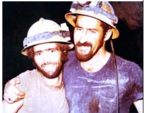
Sunshine Mine survivors

As a result of the 1972 accident, every miner in the U.S. now carries a "self-rescuer" (a breathing apparatus made with hopcalite and much simpler than a SCBA), which gives the miner a chance to avoid death due to carbon monoxide poisoning.