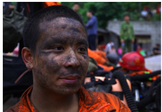
A rescuer emerges from an underground rescue operation after a gas leak at the Tonghua Coal Mine in Anwen Town of Qijiang County, Chongqing Municipality, China, May 30, 2009. The death toll has risen to 30.

CHONGQING -- Death toll rose to 30 after five more bodies were recovered in a colliery gas burst Saturday in southwest China's Chongqing Municipality, according to local coal mine safety authorities.