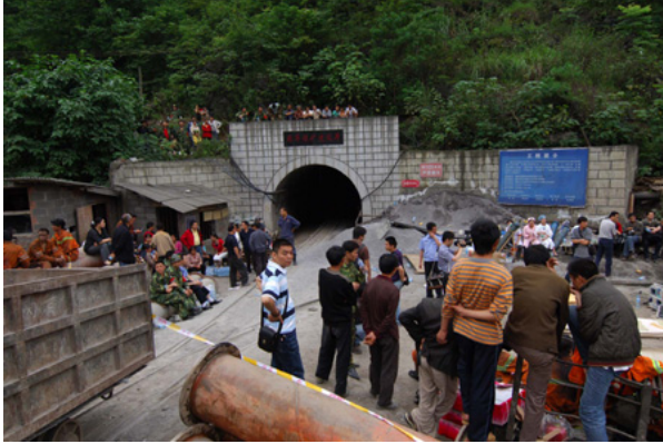
Scene of the accident.

The cause of the accident is being investigated.