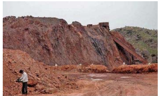
Iron ore mine at Shirago, India