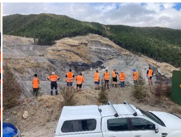
(Team looking out towards the coal seam)