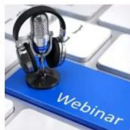
Webinar - Self Care of Quarry Personnel 24/7