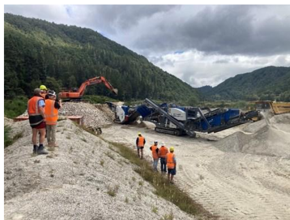
(Team watching crushing gear in action)