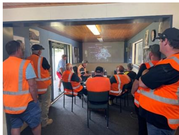
(Team viewing presentation/induction.)

For me personally the biggest take out was the water quality and treatment onsite, this was not your usual process of dosing with flocculating chemicals but instead uses recycled muscle shell (shellfish) waste from a processing plant. Don't quote me on the exact numbers but the pH of the site water coming into the treatment area is sitting around 3-4pH and once passed through the shell filtration resulted in high 6's so almost back to neutral. This water then is discharged off site and helps enhance the water quality of the nearby stream!!!