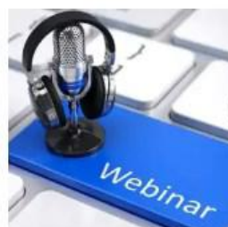
Webinar - Are you ready for retirement? 24/7