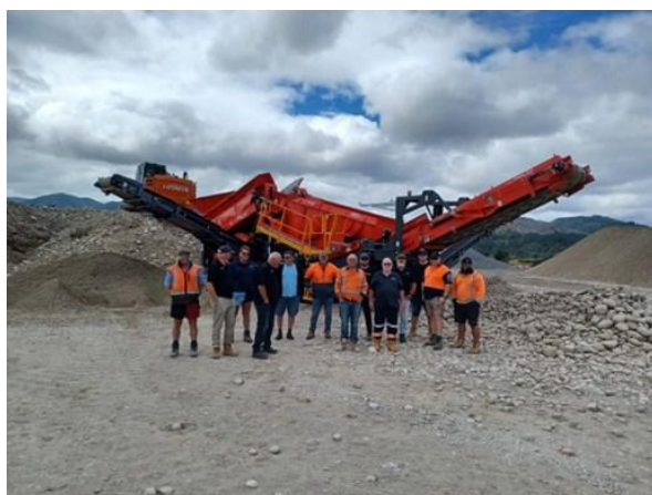
(Team pictured with the new 883 Screen)

Two of ROSCO Contracting's mobile crushing and screening operations, first site enabled the team to get up close & personal climbing all over a brand-new Finlay 883+ scalping screen, which looked a nice piece of kit. Secondly, we visited a Kleemann Jaw and closed-circuit Cone working together making AP20. We couldn't hang around too long as the local bumble bee population was more than thriving!!!!