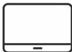
[Mini-Online Course] Ethics and Organisations - Leadership 2