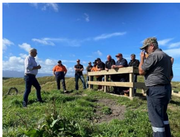
(Looking across to the sand dewatering plant from the designated viewing area and the team at the viewing area)

Next stop seen the convoy heading to West-Trak NZ for a guided tour of their premises in Westport, including the store and workshops. Amazing amount of stock on hand that should assist many with their needs. The team there also put on a fantastic BBQ lunch for us which was greatly appreciated by all.