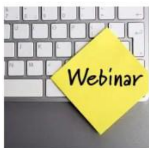
Webinars - Emergency Management 24/7