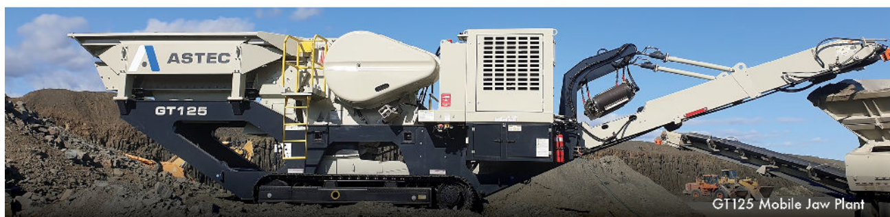
GT125 Mobile Jaw Plant

UNBEATABLE NEXT GEN MOBILE RANGE AVAILABLE NOW