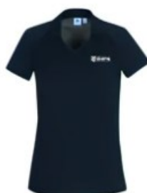
Byron Polo Women