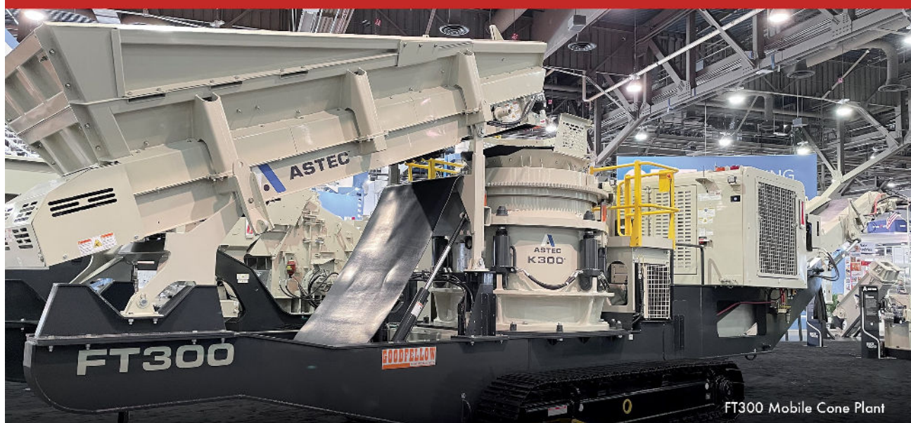
FT300 Mobile Cone Plant

UNBEATABLE NEXT GEN MOBILE RANGE AVAILABLE NOW