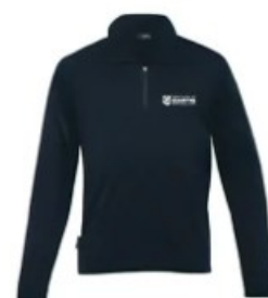
Merino Zip Pullover