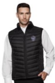
Snowy Puffer Vest