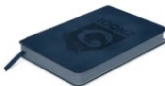
Soft Cover Notebook