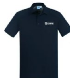
Byron Polo Men