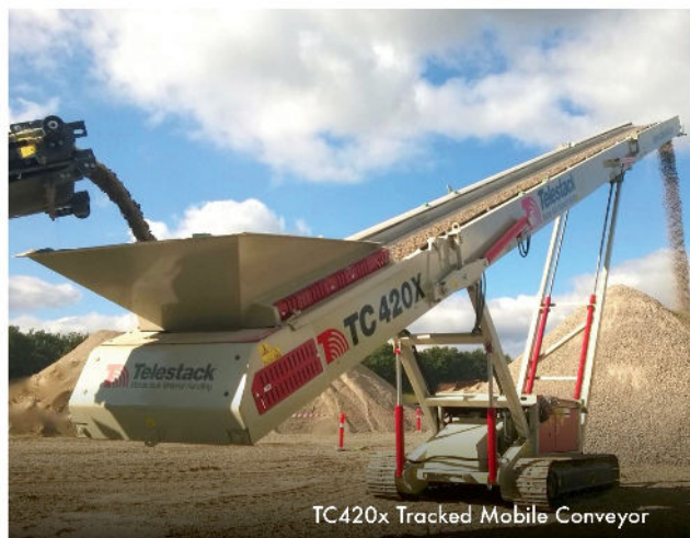
TC420x Tracked Mobile Conveyor