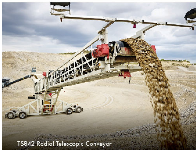
TS842 Radial Telescopic Conveyor