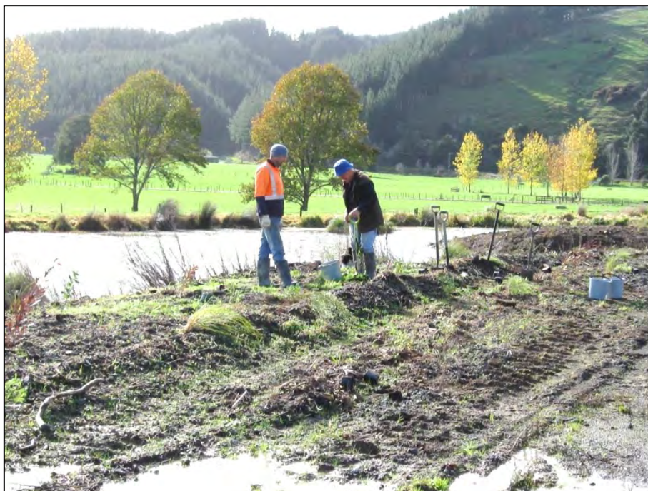
Stage 2 planting along edge of Pond 1