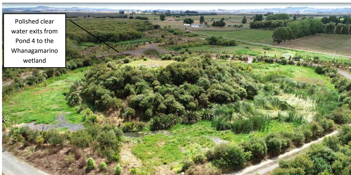
Trees are well established on the central island