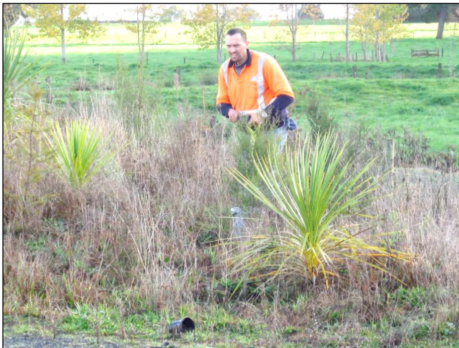
Stage 2 planting (infill between more established shrubs)