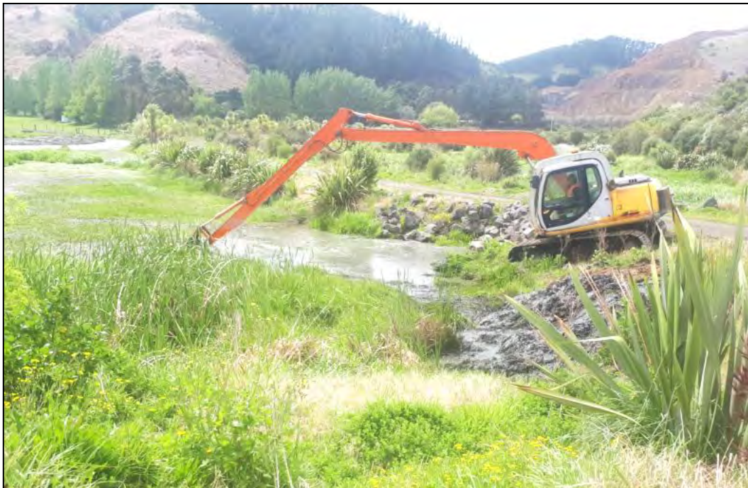
Removal of sediments near rock filter culvert between Ponds 1 and 2 with a long-reach digger is used only on an “as-required” basis