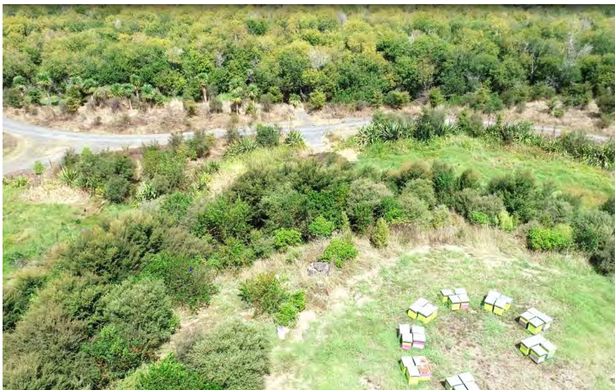
Hives of bees ideally located on top of island, sheltered from wind by trees. Bees obtain nectar from nearby manuka trees