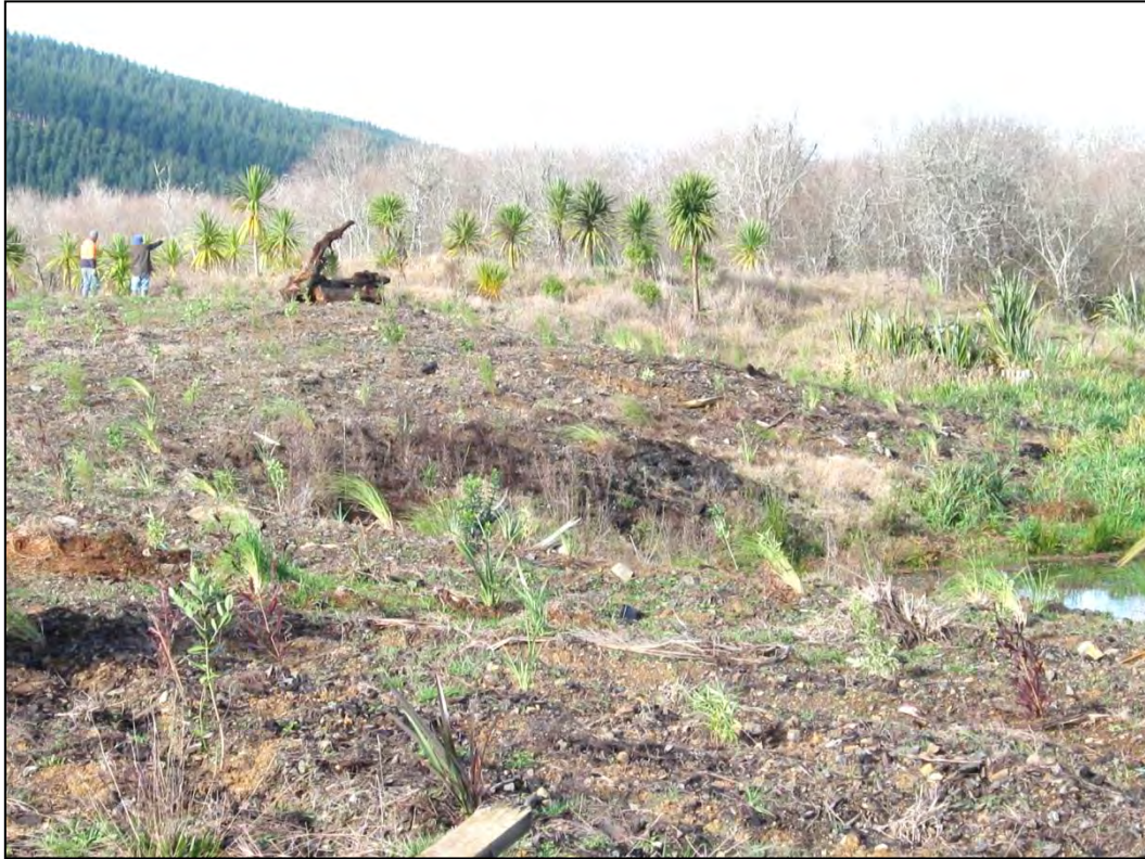
Bark mulch was spread generously to retain moisture during dry season