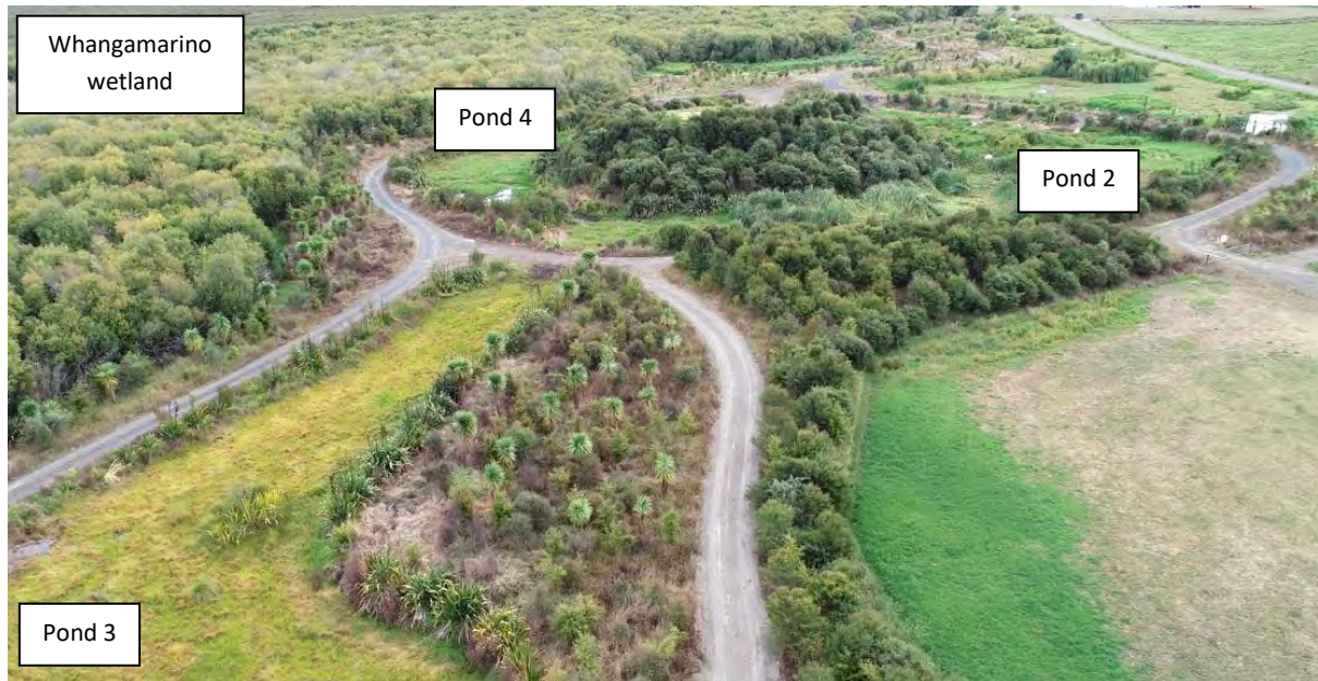
All ponds now feature prolific growth of grasses, sedges etc