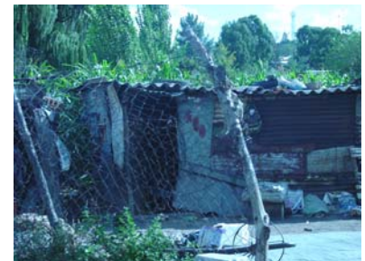
Average Soweto type home, shack

During his time as a guide he discovered that he had a talent for teaching, and story telling, which led to a career in public speaking. One of his core beliefs is that people have a lot to learn from nature. Sound business sense is linked to knowledgeable insight into how nature thrives.