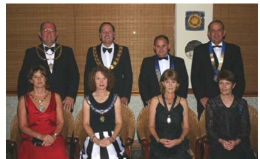
Presidents & wives at Conference South Africa