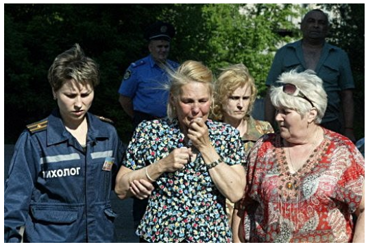
Relatives of one of the missing miners wait for news outside the Skochinsky coal mine

"We don't know what to think, they should tell us something at least. I can't even cry because I don't want to upset her," she added quietly, glancing across at her mother-in-law.