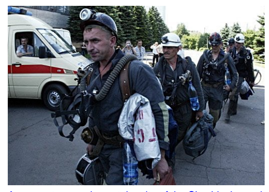
A rescue team arrives at the site of the Skochinsky coal mine

Out of 51 miners working in the mine at the time of the accident, 38 had able to escape to the surface, he said.